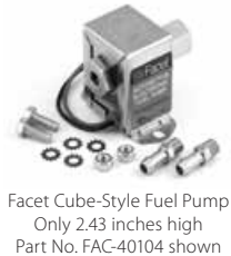
Facet Cube-Style Fuel Pump Only 2.43 inches high Part No. FAC-40104 shown

*For many more models of Facet cube-style and cylindrical fuel pumps, please call or visit our website. We also offer several other types of Facet fuel pumps, including the quiet and economical Posi-Flo series, the self-priming Dura-Lift series, and 24 volt cube-style and cylindrical pumps for marine use.