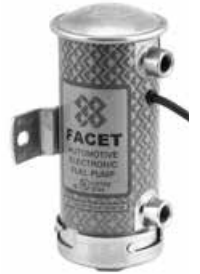
High-Performance Cylindrical Fuel Pump Only 5.37 inches long Part No. FAC-476087 shown