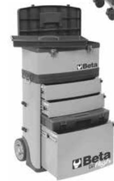
Above: C41H Two-Module Trolley Part No. BT-041000002