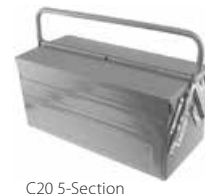
C20 5-Section Cantilever Tool Box Part No. BT-021200001