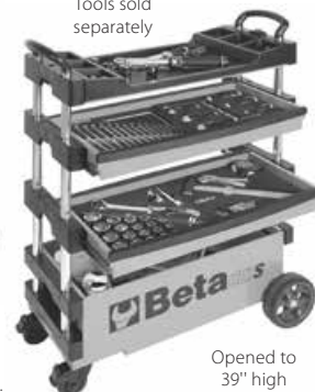
Opened to 39" high