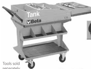
Tools sold separately