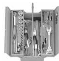
Below: C19 3-Section Cantilever Tool Box Opened to show 2 lift-out trays Tools sold separately