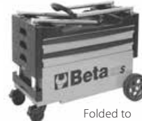
Folded to 22.5" high