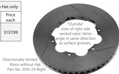
Directionally Vented Rotor without Hat Part No. 3545-23-Right