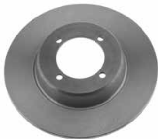
Cast Iron Rotor with Integral Hat, Standard Part No. 3545-10

* This size can be used to convert the front rotor on 1981 and older Tiga FF and S2000. Visit our website for full instructions!